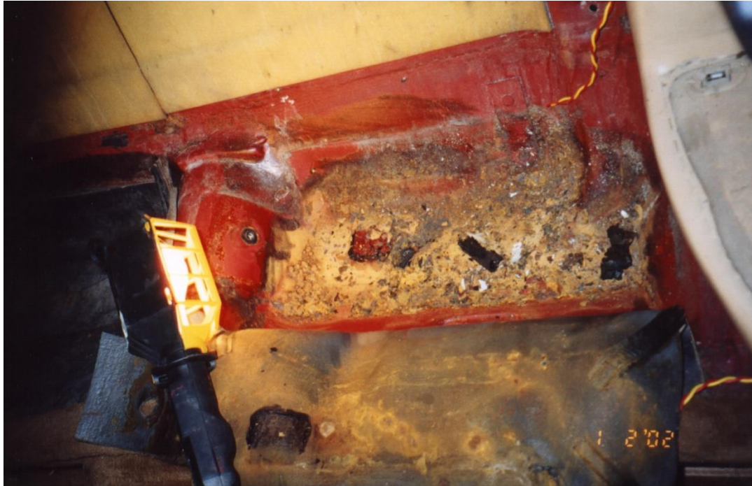
Figure 3 Right Rear Floor Pan